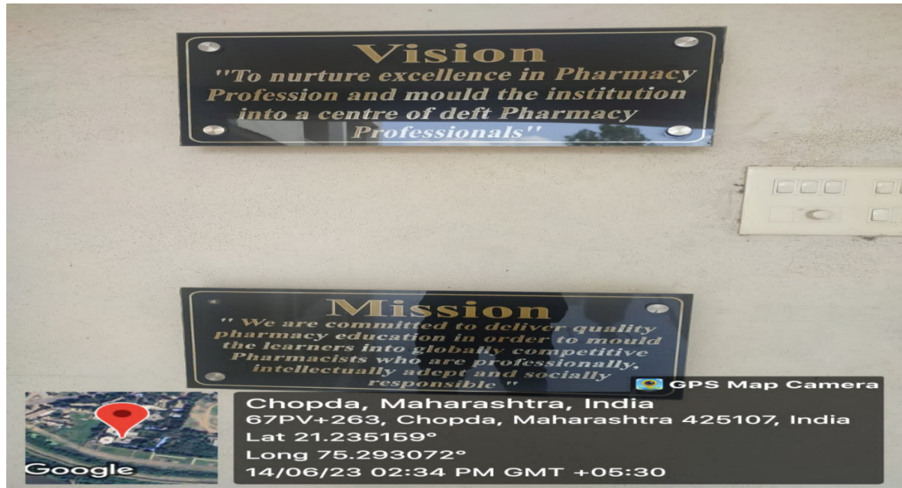
Vision & Mission at office