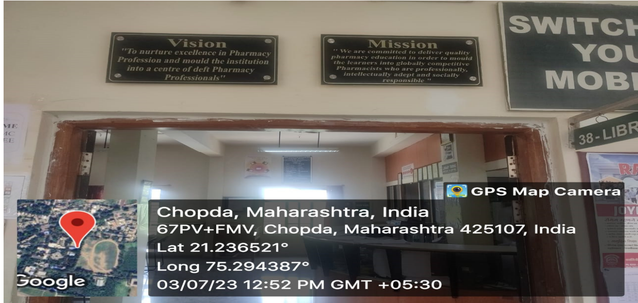
Vision & Mission at library